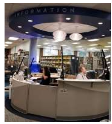
at the Information Desk in 2023!

Adults enjoyed plenty of opportunities to learn, create, and have fun too!