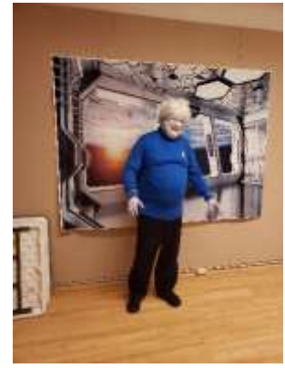
An Andorian came to speak at the Library's first-ever Star Trek Day!