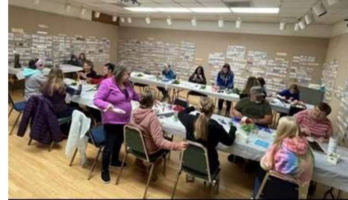
Over 5,000 questions were answered A full craft class (making hand-made home address signs).