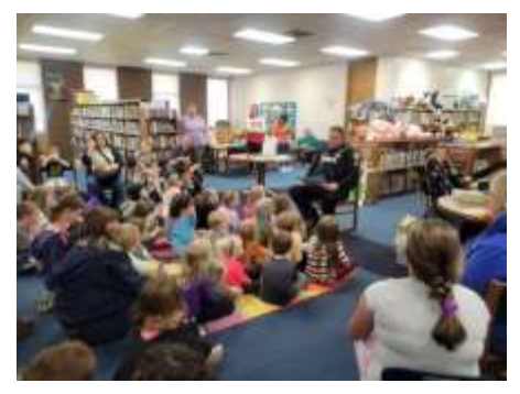
OPD officer reading about Halloween safety during our Pumpkin Patch program.

In-person programs were as popular as ever, with waiting lists in place for many children's, adult, and family programs. Not all programs require registration but are open to all who come. The Library's space challenges continued to cause us to be creative with selecting locations for programs or, in some cases, having to limit attendance for safety reasons.