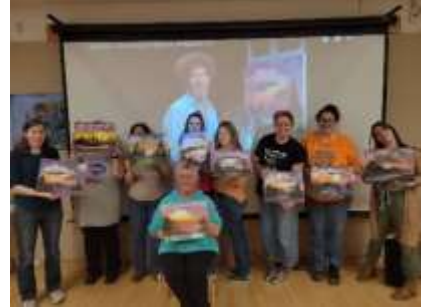
Painting with Bob Ross!

Adults enjoyed plenty of opportunities to learn and create too!