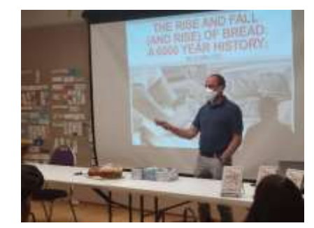
A talk on the history of bread.