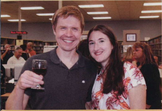
(left) There were many first-time attendees at this event making up 140 tickets sold. (below) Guests were all smiles, and we can't wait for FeBREWary!