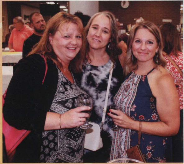
(left) Guests enjoy the wine almost as much as each other's company.